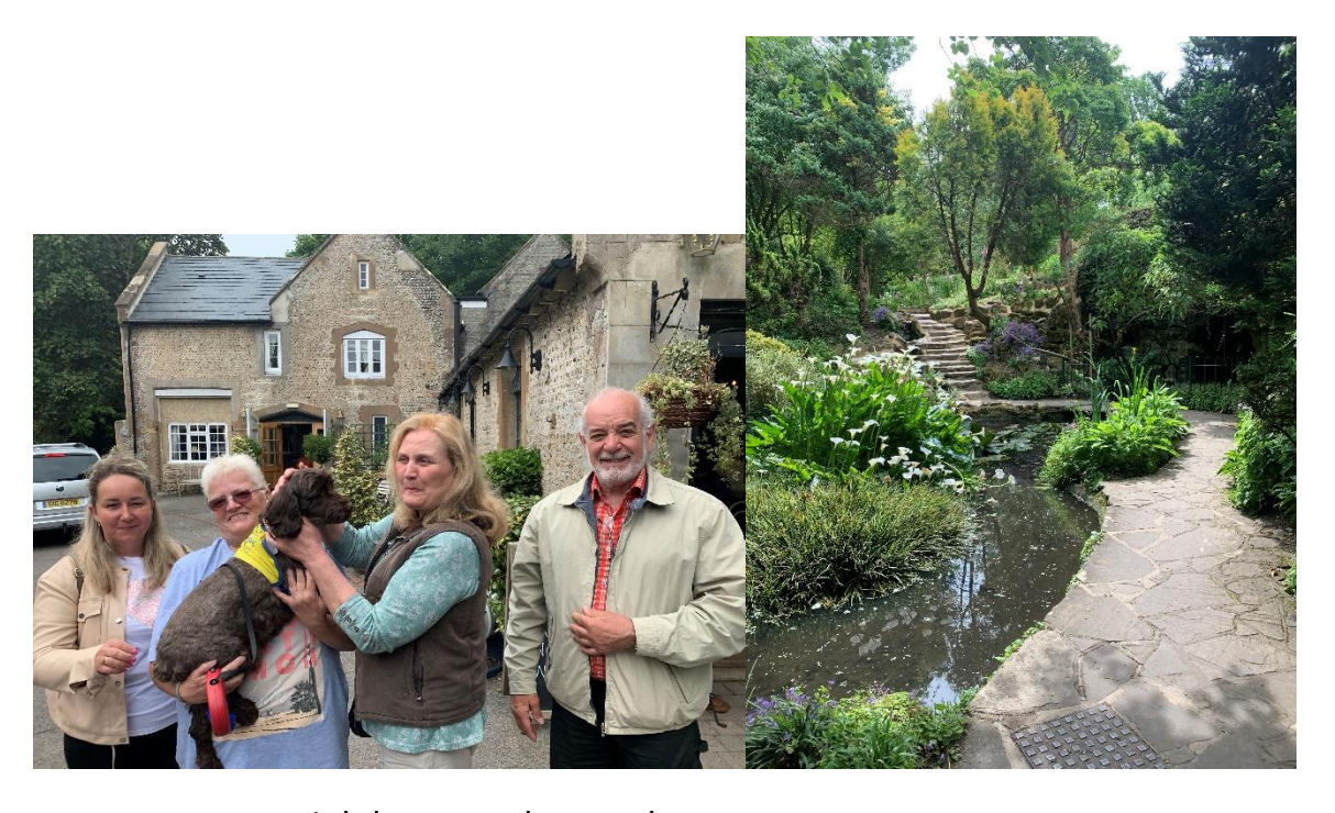
AAW meet up at Highdown Gardens and Tea Rooms.